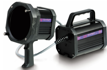
PS135 - Duo with Pistol Handle