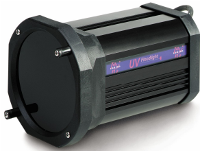
135 - Compact with No Handle 135TL - TrAc Light with No Handle