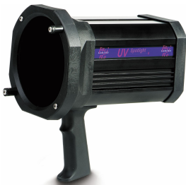
PH135 - Compact with Pistol Handle PH135TL - TrAc Light with Pistol Handle