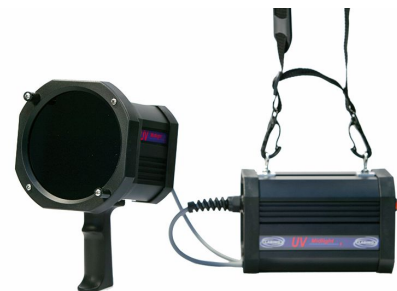
TLP - TrAc Light Pro