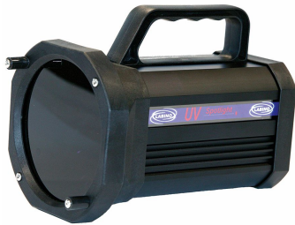
H135 - Compact with Top Handle H135TL - TrAc Light with Top Handle