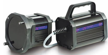
S135 - Duo with No Handle