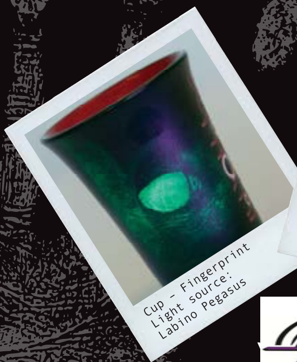
Cup – Fingerprint Light source: Labino Pegasus

FULL PEGASUS CRIME KIT (Article Number LI04) – Includes 3 lamps that host 7 different wavelengths (UV-365nm, Blue-455nm, Cyan-505nm, Green-530nm, Amber-590nm, Red-625 and White Light), 3 contrast goggles (red, orange, yellow), 1 UV protective goggles, 1 charger, 1 carrying case to fit all three lamps, forensic camera filter kit.