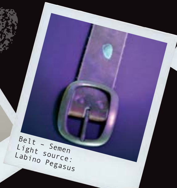
Belt – Semen Light source: Labino Pegasus